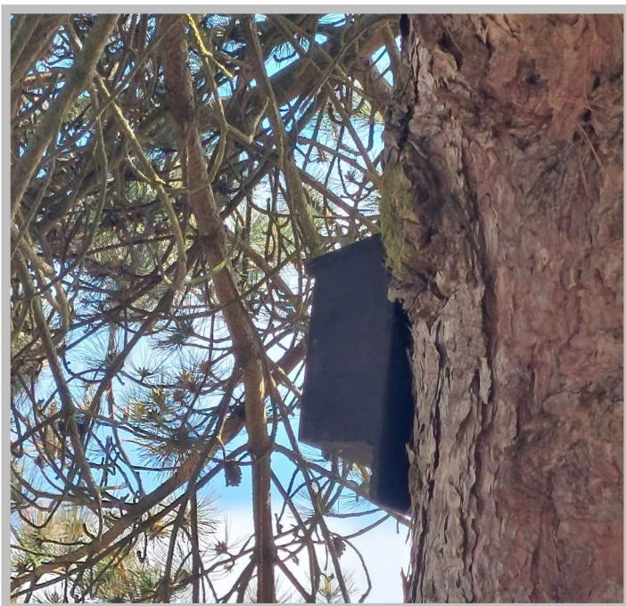
Figure 6: Bat boxes deployed within Hill Wood.

The Site is currently conducting enabling works to facilitate the sale transfer of an area of land to Sizewell B Station. The land is situated to the west of the Site footprint and formerly housed the Site's National Grid Substation. Facilitating works has addressed changes to the Site's perimeter, installation of a new borehole, soil characterisation sampling and the severing of Site services from the area. The contracts between the two sites are expected to be exchanged in June 2024.