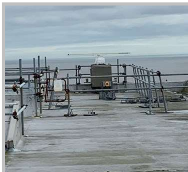
Figure 8: CEFAS Radar on Reactor Building Roof

A radar and cameras have been installed on the Reactor Building Roof along with computer equipment, radio receiving equipment, and a data logger internally. The purpose of this equipment is to monitor and provide data for coastal erosion.