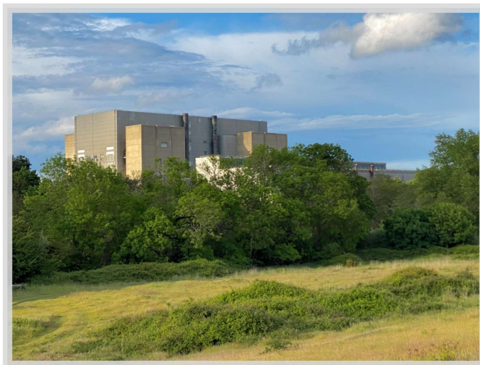
Figure 1. View of Site from the South-East

Following a period of extensive public consultation the HSE granted consent in May 2006, subject to certain conditions (listed in full in Appendix A). Condition 2 requires the licensee to prepare an Environmental Management Plan (EMP) which shall: