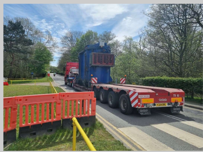
Figure 13: Removal of Turbine Hall Generator from Site

'Out of Scope' wastes are those generated which have been assessed as being 'out of the scope' of the requirements of the Environmental Permitting Regulations for radioactive material. These wastes are processed and packaged on Site before being transferred to a holder of an Environmental Permit for further treatment or disposal as Controlled Waste.