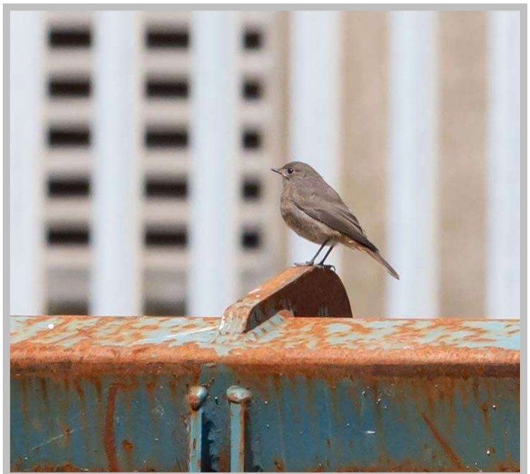
Figure 7: Female Black Redstart — Pictured in 2023

The Site's Black Redstarts had a successful and productive nesting season during 2023 with several new juveniles spotted around the Site on environmental walkdowns.