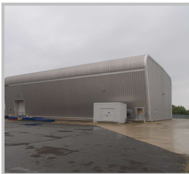
Figure 9: Bradwell Site Interim Storage Facility for ILW

ILW packages from Sizewell A Site will be consolidated at Bradwell Site's Interim Storage Facility. This will negate the requirement to construct an Interim Store for ILW at Sizewell A Site.