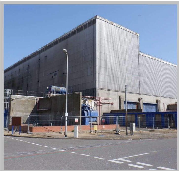
Figure 5: Turbine Hall Building

Company and Site Management Control Procedures (see Appendix B) ensure that decommissioning activities are carried out in accordance with the Environmental Management Plan. All changes to the configuration of plant and systems are assessed, during the proposal stage, against the requirements of the Environmental Management Plan and, where appropriate, mitigation measures are put in place to prevent impacts identified. This is part of the company integrated management system which is certified to ISO 9001, ISO 14001, and ISO 45001. In addition, where there is the potential for an activity to produce significant discharges or disposals, either radioactive or non-radioactive, the Site undertakes Best Available Techniques (BAT) studies in accordance with the Company Process S-391 (Options Assessment for Radioactive Substances Legislation BAT/BPM Compliance).