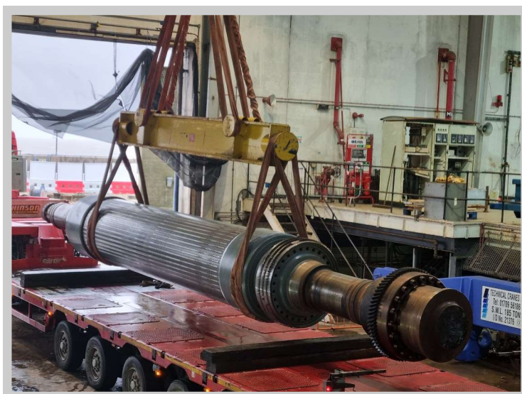
Figure 12: Despatch of Turbine Rotor

Radioactive plant and equipment in areas such as the Reactor Building may be decontaminated and dismantled, in-situ where practicable and recycled where possible. Contamination control provisions would be applied (e.g. work completed within temporary enclosures) and working procedures will take account of the requirement to minimise workers' exposure to radiation to As Low As Reasonably Practicable (ALARP). Following decontamination and de-planting, buildings scheduled for demolition during Deferral Preparations will be demolished, using conventional techniques. Radiological monitoring checks will be made on the buildings as demolition proceeds and on the resulting demolished materials prior to re-use or disposal.